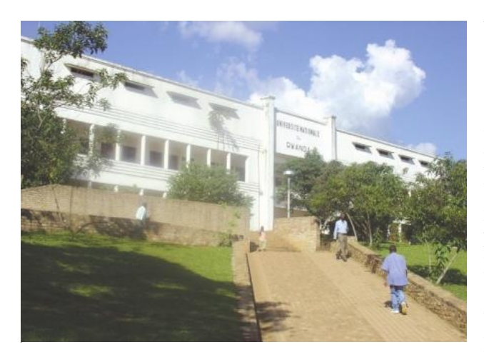
Figure 5. Université Nationale du Rwanda, Butare.

should expect from my students. These were faculty members who spent as little time as possible at the University and who seem to think of Butare as a kind of country club.