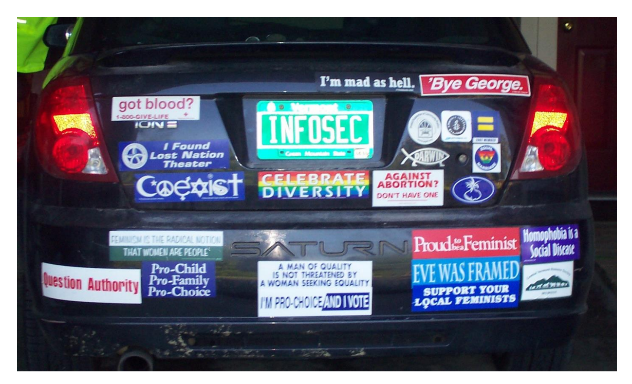
Figure 8. Bumper-sticker mania. Note lower left hand sticker.

The other aspect of teaching that I enjoy is showing students the importance of questioning authority. I actually reward students who challenge me in class or outside of class by awarding extra points for useful corrections. When students write exams, I ask them to make notes about bad questions or ambiguous answers – and give them points for their trouble. I remember one MSIA student in the first couple of cohorts who timidly suggested that there might be a mistake in one of the commentaries; there was, and I added some points to her score for the seminar. She was amazed. When she told some friends of hers who were attending a local university, they were astounded: they said that their professor would scowl at them and give them a hard time if they even suggested a correction. I think all of us should practice egoless work (see my essay "On Writing" < <u>http://www.mekabay.com/methodology/writing.pdf</u> > for details), especially when we're teaching.