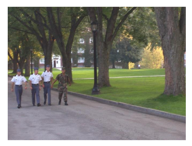
Figure 7. Norwich University Upper Parade Ground, Northfield, VT.

Recently I have had the privilege of helping a high school senior with learning, attentional and