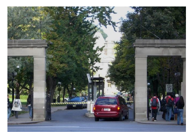
Figure 3. Roddick Gates of McGill University.

At McGill University, I had terrible grades. From having been 10<sup>th</sup> in the province of Québec with a 92.5% matriculation average I fell to the bottom of the C- grade. It took four years for me to figure out that doing badly was my unconscious rebellion against the domineering father who had punished me throughout childhood every time I came home with a less than perfect exam score. I still remember the time my report card read 100%, 100%, 100%, 100%, 100%, 99%, 100%, 100%, 100% – and he yelled abuse at me for three days for being a fool